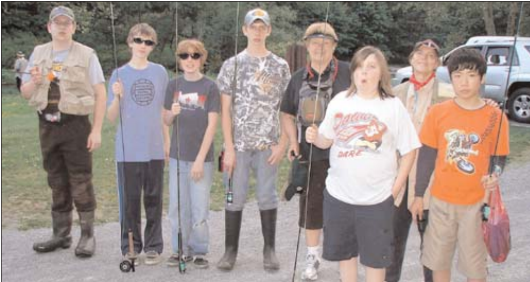
STREAMBOUND... Trout in the Classroom students and volunteer mentors get ready to wet a line at Fisherman's Paradise May 20.