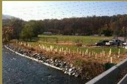
Above Commercial Street Bridge Before and After Construction of 200' Mudsill