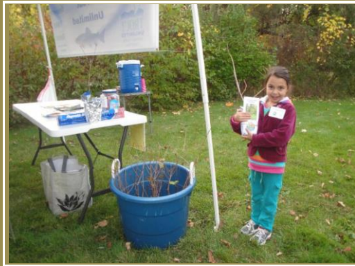
A Free Seedling

In November we will be mailing the Trout Unlimited publication "My Healthy Stream - A Handbook for Streamside Owners" to the same streamside property owners between Boalsburg and Houserville. Funding and other support is being provided by the League of Women Voters of Pennsylvania Citizen Education Fund through a Growing Greener grant from the Pennsylvania Department of Environmental Protection.