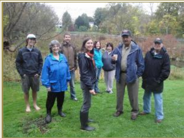
College Township Outreach