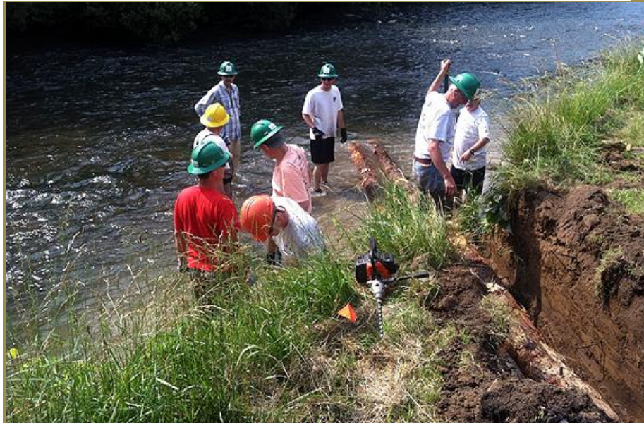
Volunteers Preparing a Multi-vane Log Deflector near Milesburg

In 2013, the Spring Creek Chapter of Trout Unlimited established an Endowment Fund through the Centre Foundation. By contributing to the SCCTU's endowment, donors can make a lasting difference for the Spring Creek Watershed. More information regarding the Centre Foundation can be found at www.centrecounty.org . For more information regarding the SCCTU Endowment CLICK HERE