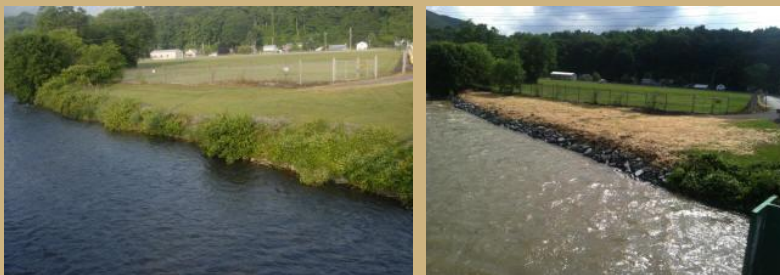
Above Commercial Street Bridge Before and After Construction of 200' Mudsill

Following are pictures from the Lower McCoy Bank Stabilization Project in Milesburg.